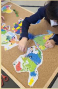
The children were given the opportunity to identify the continents