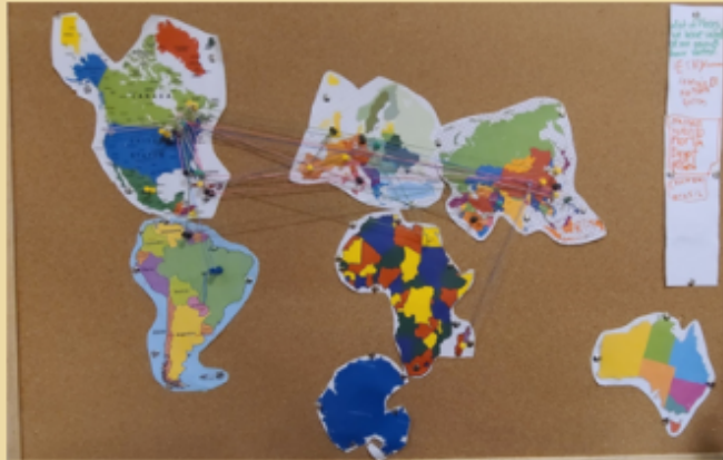
The children assisted in creating the map and talking about their travel journey.