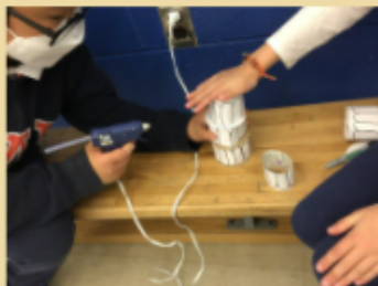
A pair of students recreated the Leaning Tower of Pisa Structure