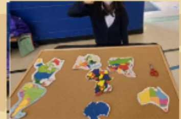
The students were able to identify places where they visited with families or places their parents come from