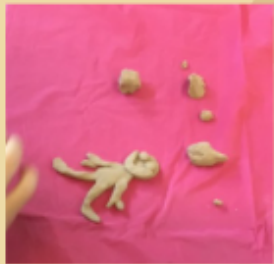
The students discussed female leaders of the world. Using clay, the children produce figures that represented some of these women.