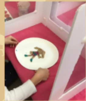
The students then painted their figures.